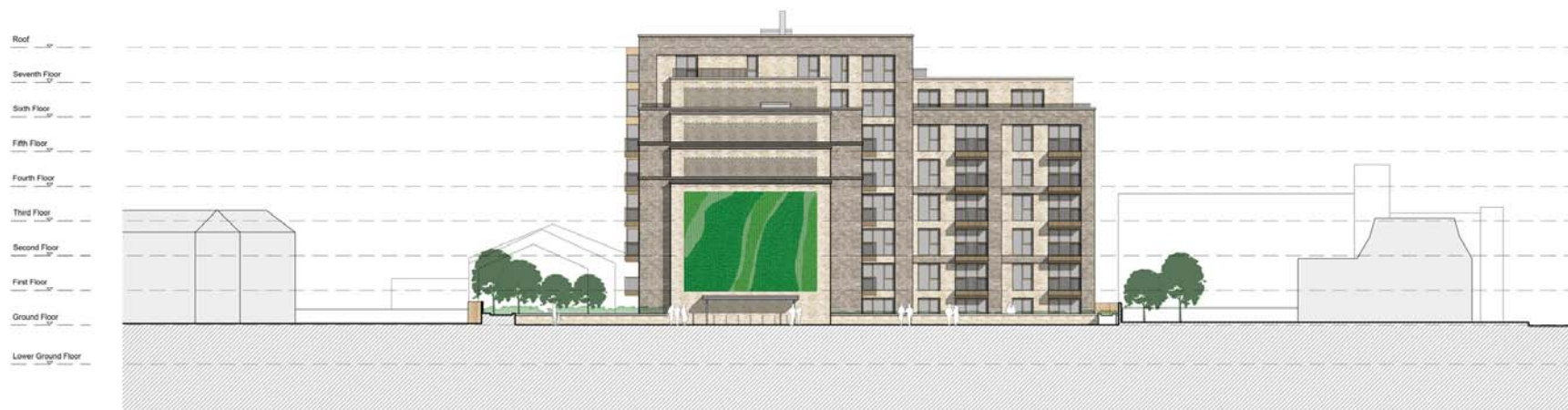
WEST ELEVATION 1:200