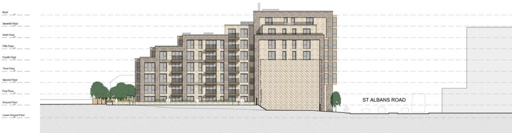
SOUTH ELEVATION 1:200